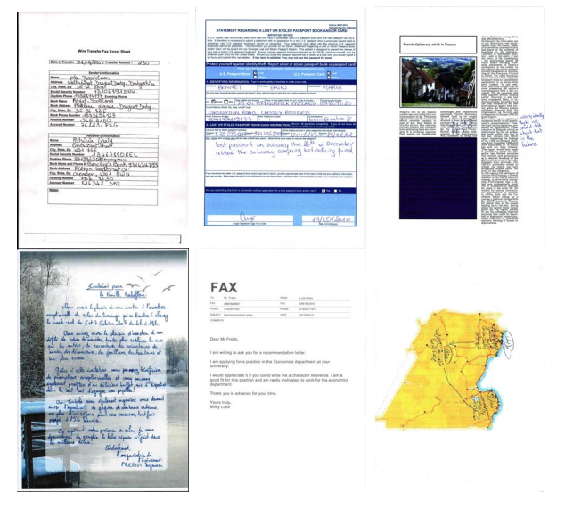
Fig. 1: Samples of documents from the Maurdor database.

The goal of the Maurdor evaluation campaign [6] was to evaluate the performance of automatic document processing systems on a large variety of complex multi-lingual documents, as show on Figure 1. The complete document processing chain was decomposed into autonomous modules: document layout analysis, write type identification, language identification, text recognition, logical organization and information extraction. Each module was evaluated in isolation with the ground-truth value of the data from the previous module in the sequence. The text recognition modules were evaluated using as input the co-ordinates of the text zone, the write type of the text and the language. We describe in this paper our system for this task and the result of the evaluation. The Maurdor database was provided to train and evaluate the systems. Official splits of the database with the number of text zones are presented on Table I.